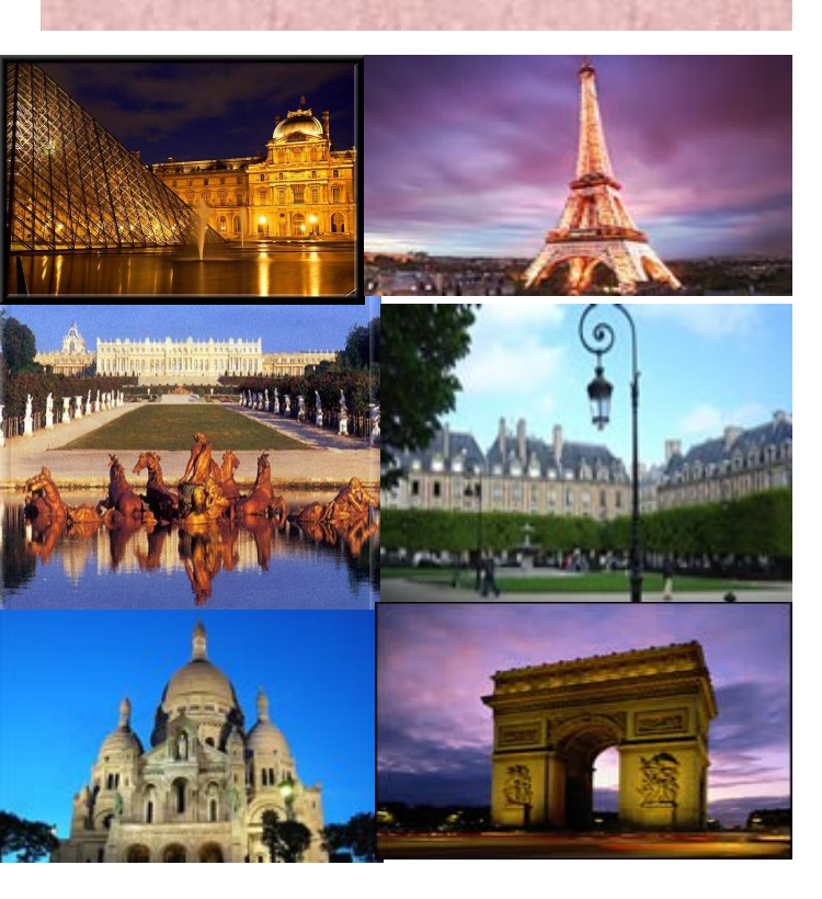
"What an immense impression Paris made upon me. It is the most extraordinary place in the world!" Charles Dickens